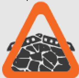
Ground or strata

Following heavy rain, approximately 60 tonnes of loose material slipped onto a ramp. The ramp was not in use and had been bunded off at the top. Nobody was injured.