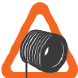
Mine shafts and winding systems

Mine operators must ensure that stringent monitoring and quality control of maintenance and repair activities is undertaken on winders. Enough time and resourcing must be allocated for maintenance and repair tasks.