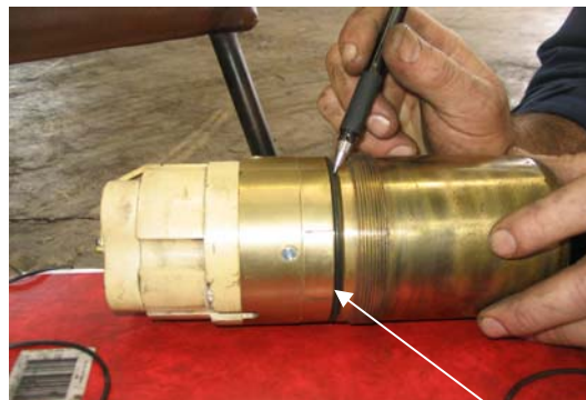
Earth contact points shown joined