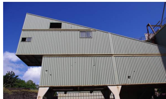
Flyrock damage to building