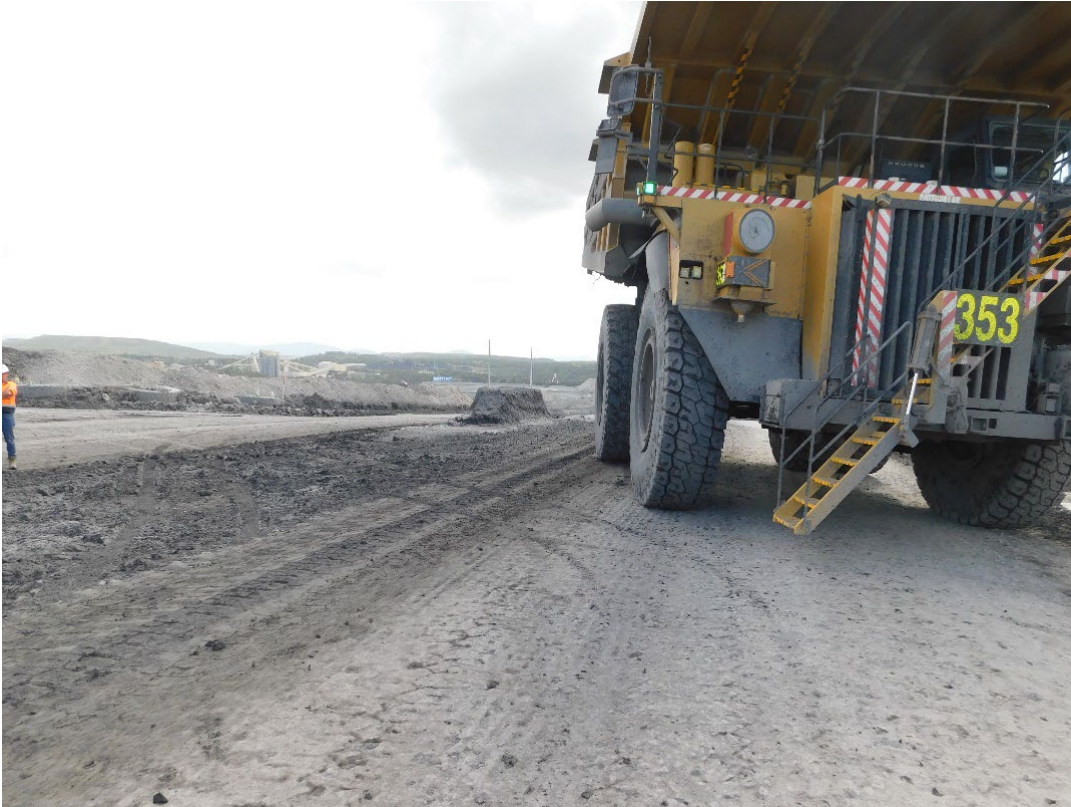
Light vehicle driver failed to see haul truck