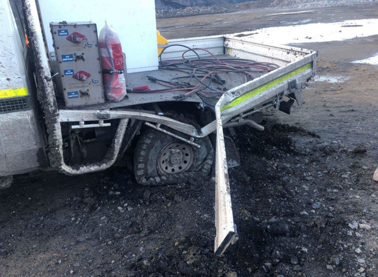
Failure to observe hazard