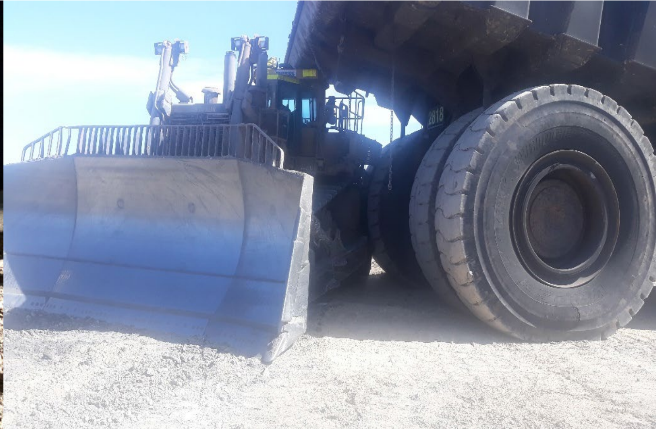
Failure to use positive communication