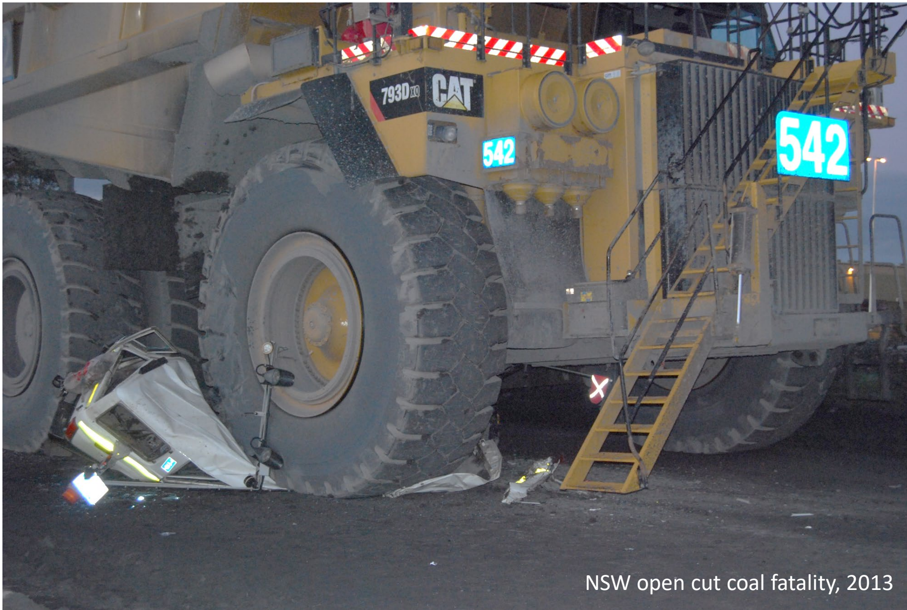
NSW open cut coal fatality, 2013