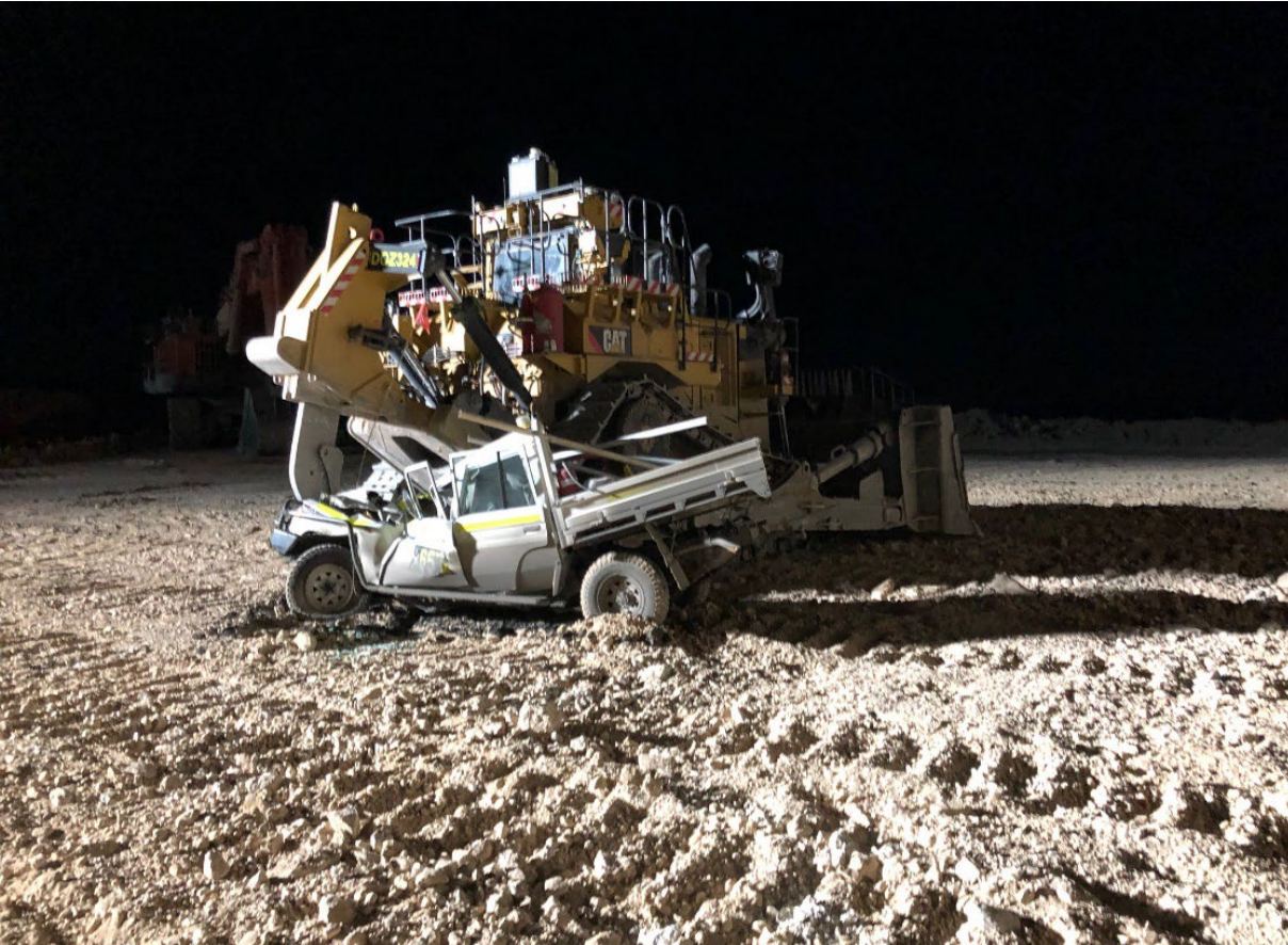
Failure to park vehicle safely