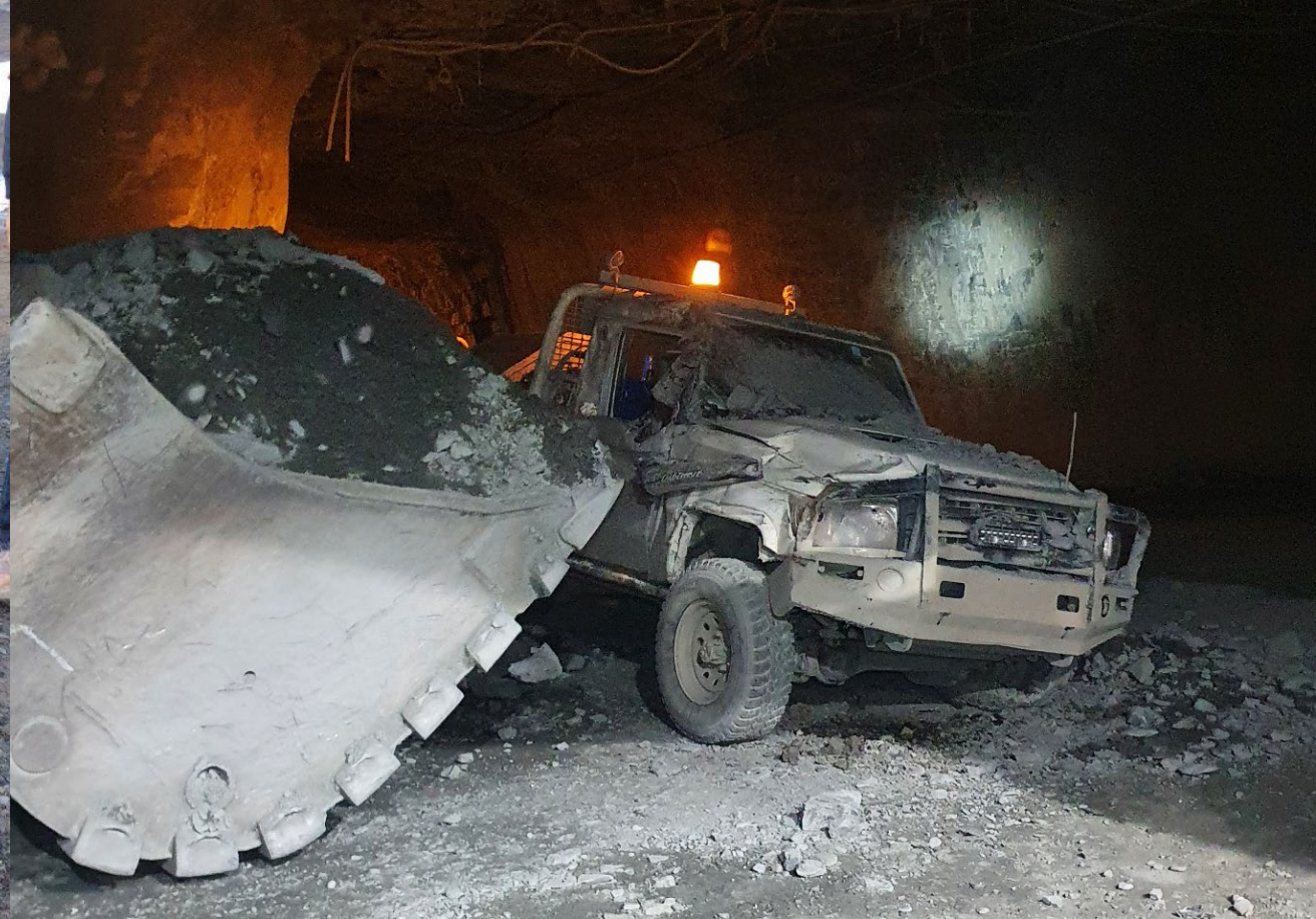
Failure to use positive communication