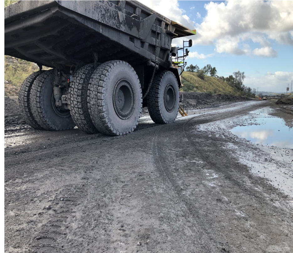
Light vehicle driver failed to see haul truck