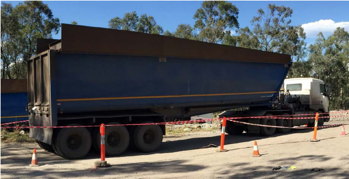
Figure 4: Truck and Muscat trailer involved in the incident.

Mr Norman used a shovel to pry open the tailgate and propped it open with a handmade tool (pipe wrench) as shown in figure 5.