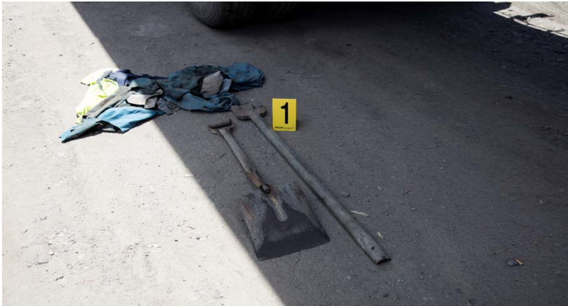
Figure 5: Handmade tool and shovel.

Mr Norman used a shovel to pry open the tailgate and propped it open with a handmade tool (pipe wrench) as shown in figure 5.