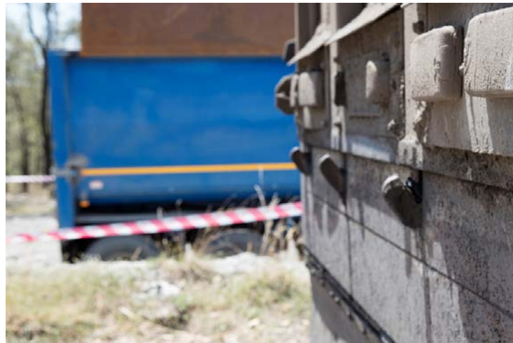
Figure 7: Trailer locking devices.

The exact location where Mr Norman attempted to prop the tailgate cannot be definitively established.