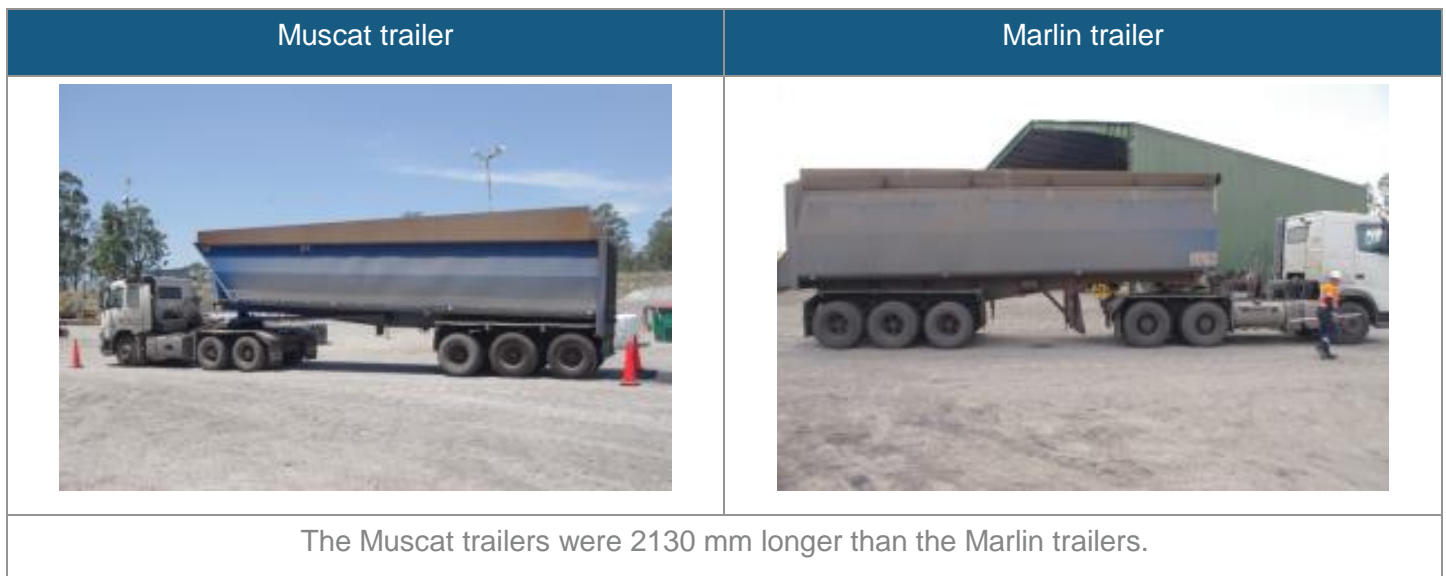
Figure 9: Differences between the Marlin and Muscat trailers.

The differences between the trailers are shown in figure 9.