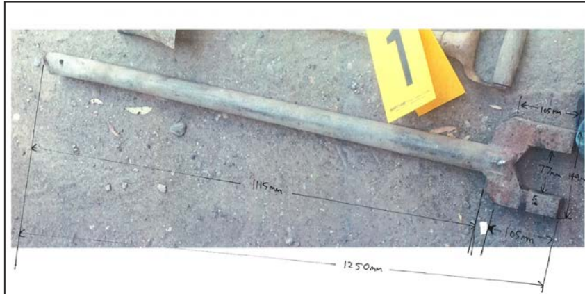
Figure 6: Handmade tool used to prop open the tailgate of the Muscat trailers.

The tool used as a prop during the incident was a handmade tool described as a pipe wrench or breaker bar. It was 1250 mm in length as shown in figure 6. This tool had been on the site for many years and was used by Mr Norman for several different functions that he carried out at the mine site.