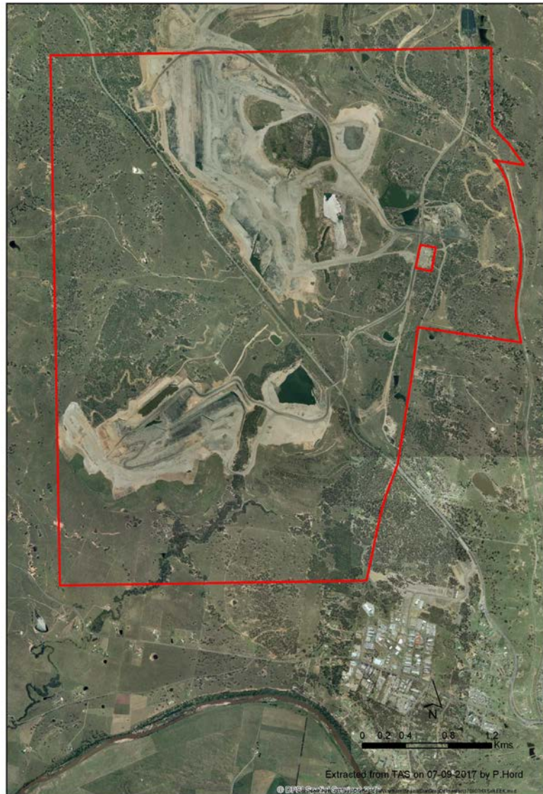
Figure 2: Boundary of coal lease, CL352

CL352 was renewed on 16 November 2009. The boundary of CL352 is shown in figure 2.