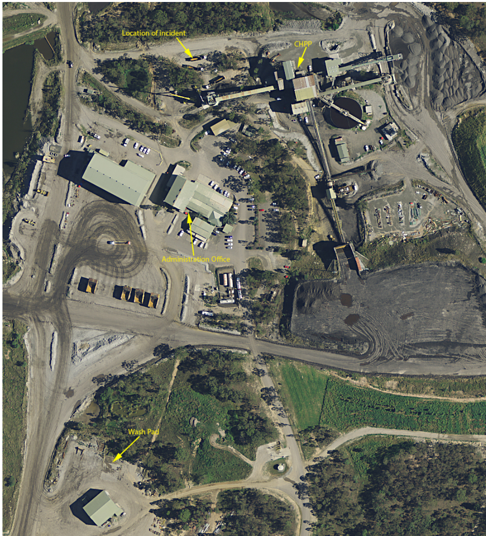
Figure 3 Location of the incident.