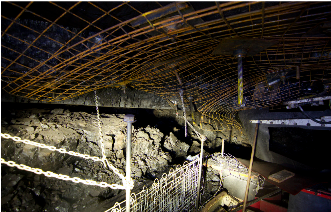
Rib on the left of the bolter miner after the workers were recovered.

Two mine workers died when a major rib/sidewall burst event occurred in a longwall development gate road during mining operations. Material from the rib engulfed the two workers who died at the scene. Five other members of the mining crew escaped injury and initiated the mine emergency response system. Investigations into the incident are ongoing.