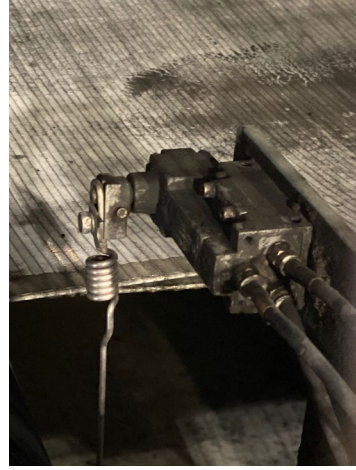
Figure 3 – Adjacent filter with cat's whisker fitted