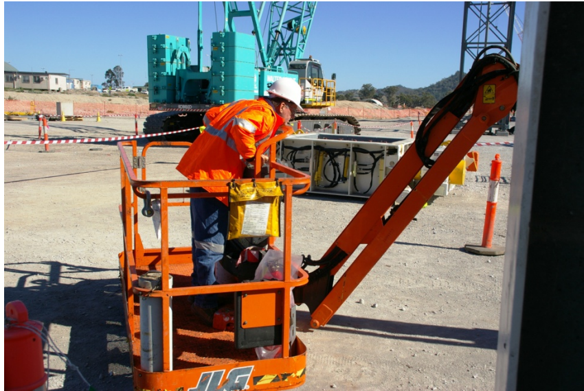
Simulation showing position of the worker in the MEWP at time of incident

Investigators are working to identify the cause and circumstance of the incident.