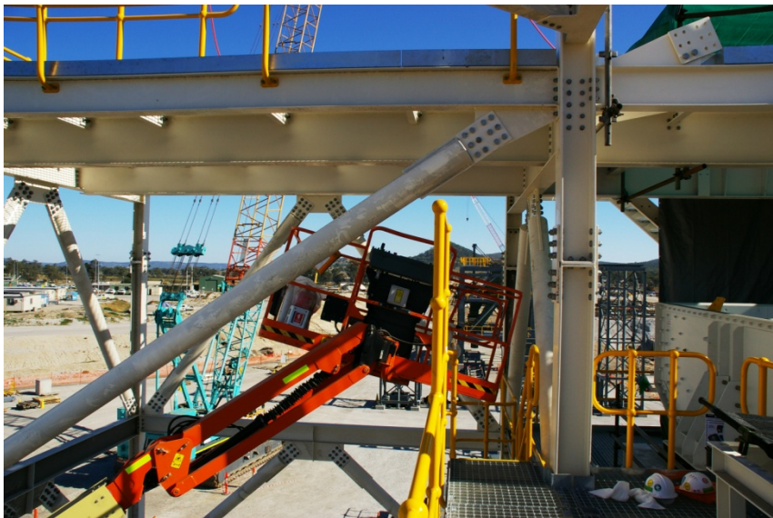
Position of MEWP basket (after recovery of worker)

The deceased was using a mobile articulated boom MEWP (rough terrain diesel knuckle boom). The MEWP was rated for an 18.3 metre lift and maximum load of 230 kg.