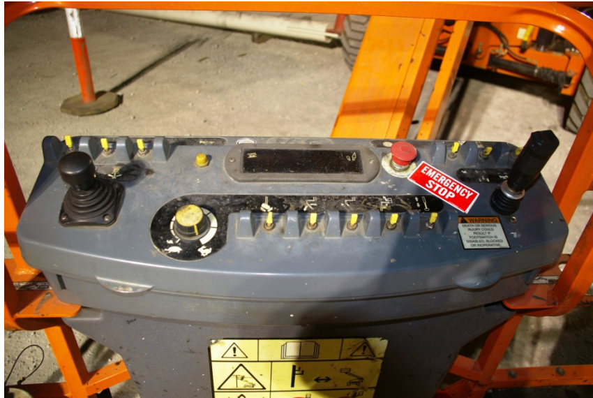
Control console on a similar MEWP basket

A guard rail was positioned above the operator's console, intended to safeguard the console and control levers from being struck by any obstructions in the work zone. This can be seen at the extreme upper edge of the above photo.