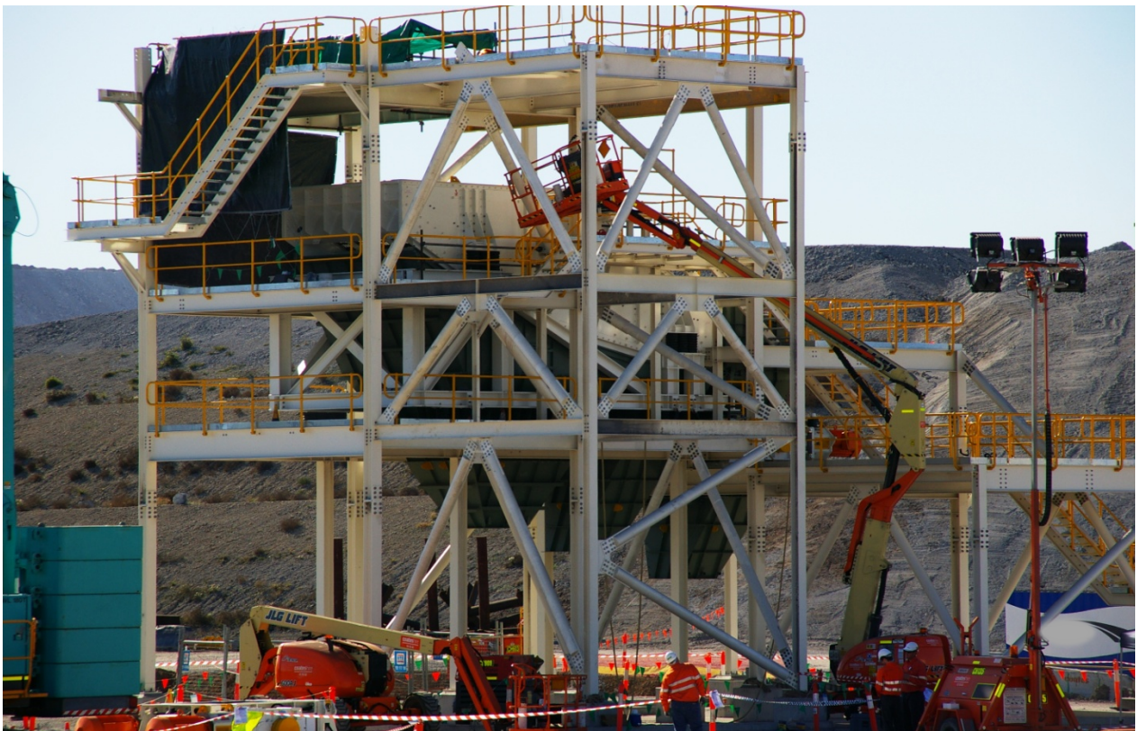
Steel structure with MEWP in approximate position (after recovery of worker)

A construction worker was using a mobile elevated work platform (MEWP) within a steel structure when his head was crushed between the protective rail of the MEWP work basket and an overhead steel beam about 14 metres above ground level. Investigations into the incident are continuing.