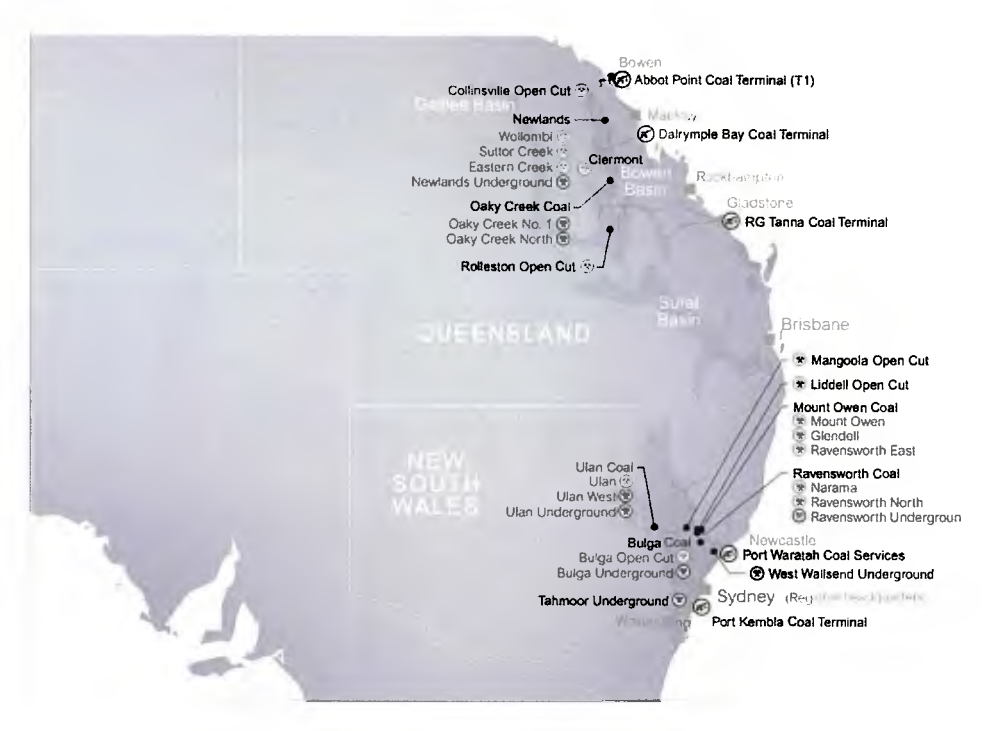
Figure 1- Glencore's coal operations in Australia

Glencore's customers are industrial consumers, such as those in the automotive, steel, power generation, oil and food processing. We also provide financing, logistics and other services to producers and consumers of commodities. Glencore's companies employ around 181,000 people, including contractors.