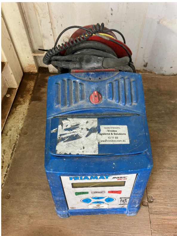
Figure 2 - The electrofusion welder used in the work task

Once the coupling and 2 pipe pieces were fitted together, the workers set up the electrofusion welding unit by connecting the electrodes to the coupling. The workers then scanned the supplied barcode that was affixed to the coupling. The barcode provided the product information the welding unit required to automatically adjust the welding settings. In this instance, the welding unit determined the applicable welding time to be 1040 seconds.