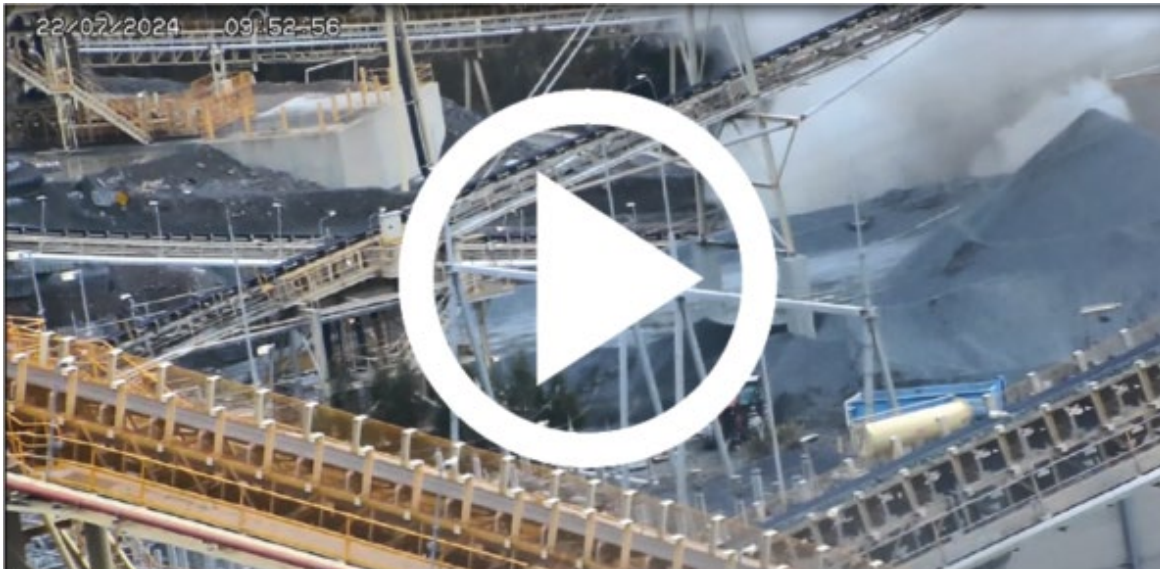
Figure 3 - CCTV footage of the tunnel explosion (top right of photo)

There were no injuries as a result of the incident.