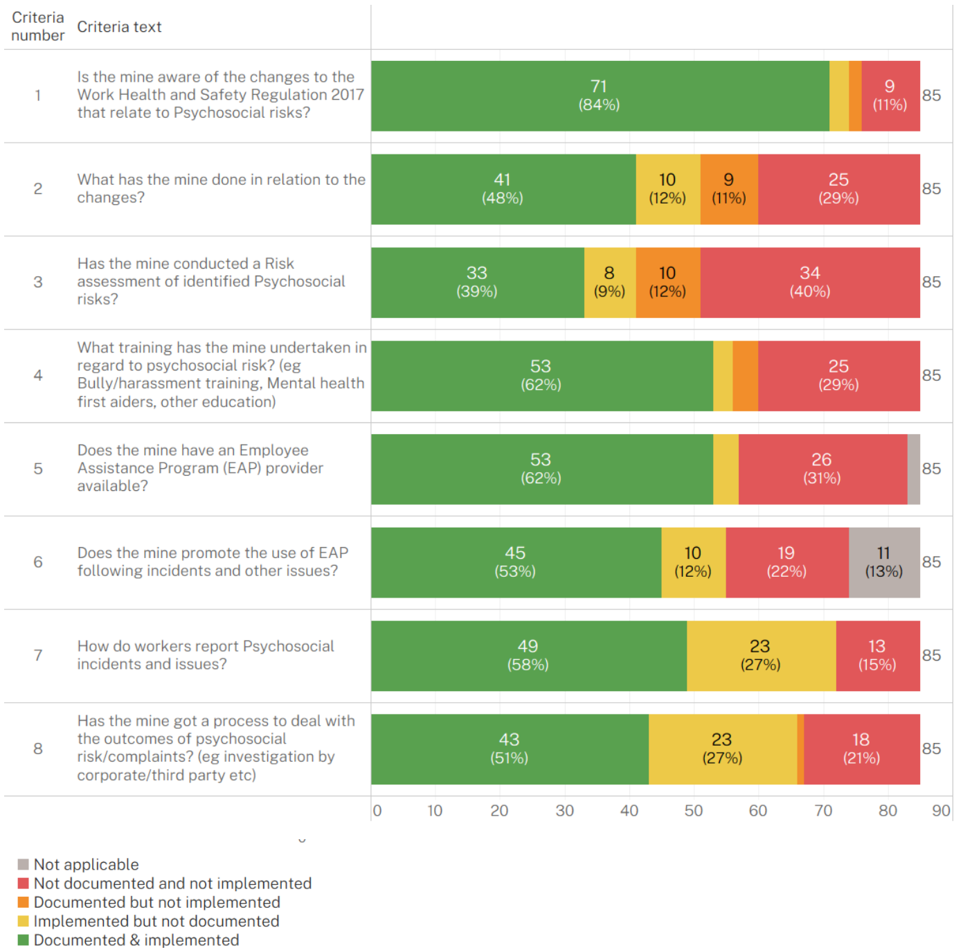
Figure 3. Overall assessment findings ratings by criteria for small mines