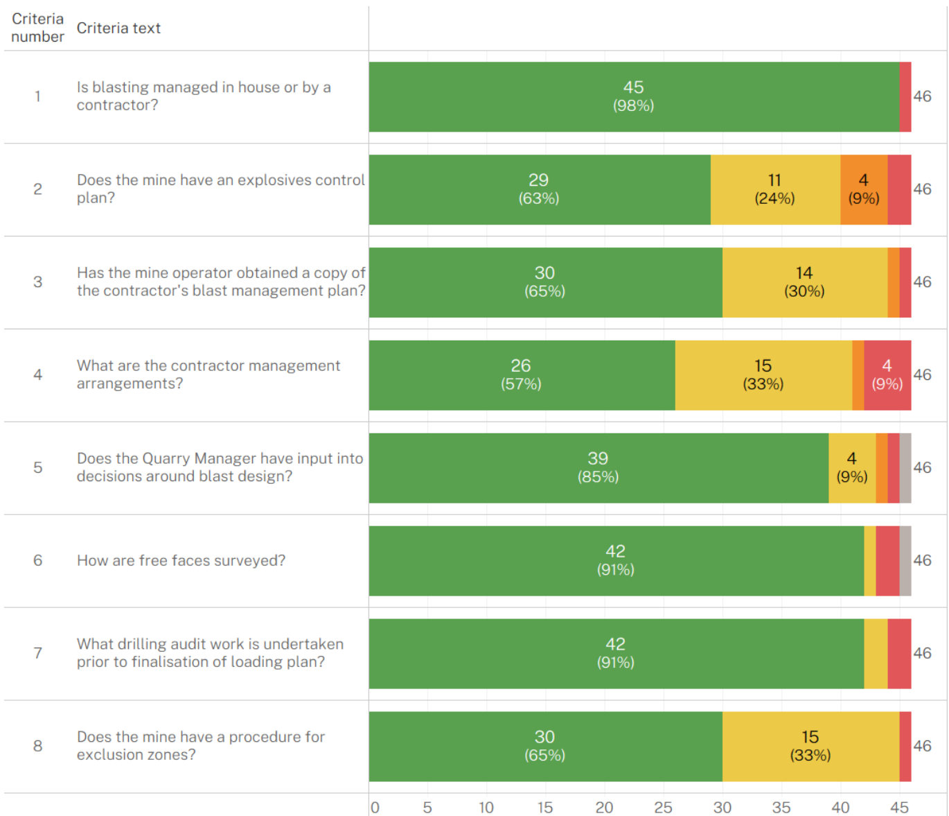
Figure 3. Overall assessment findings ratings by criteria for small mines