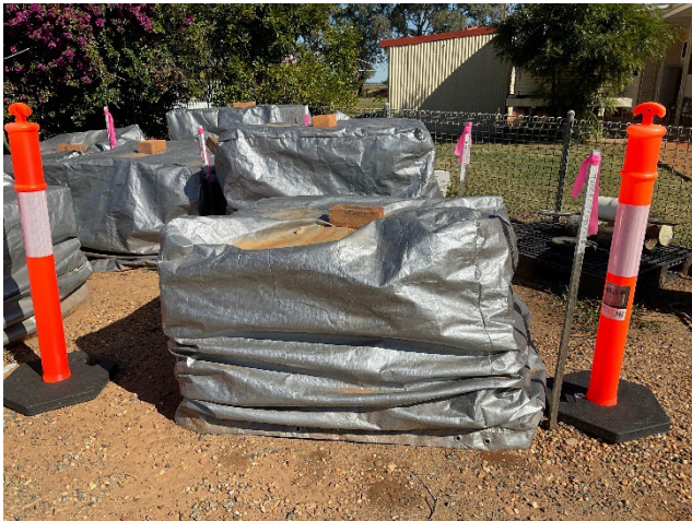
Figure 5 Palletised and covered core storage