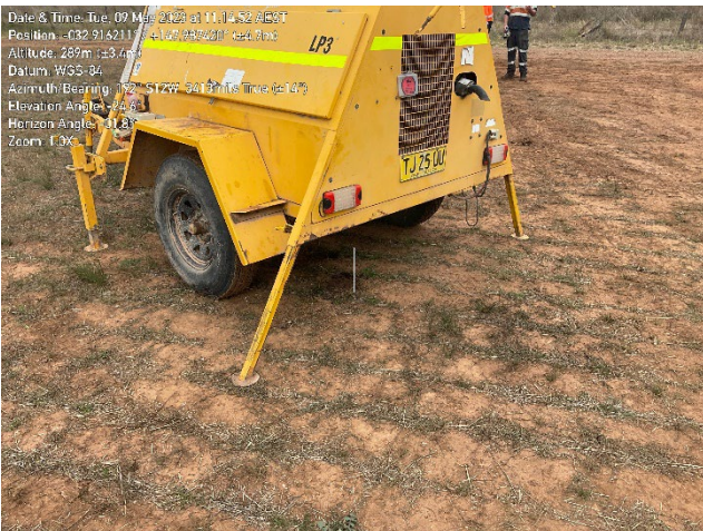
Figure 1 Lighting plant with no spill protection underneath