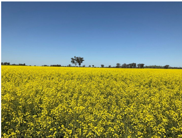
Figure 3 The site of the Forest Hill air core drilling program is now under canola crop after successful rehabilitation