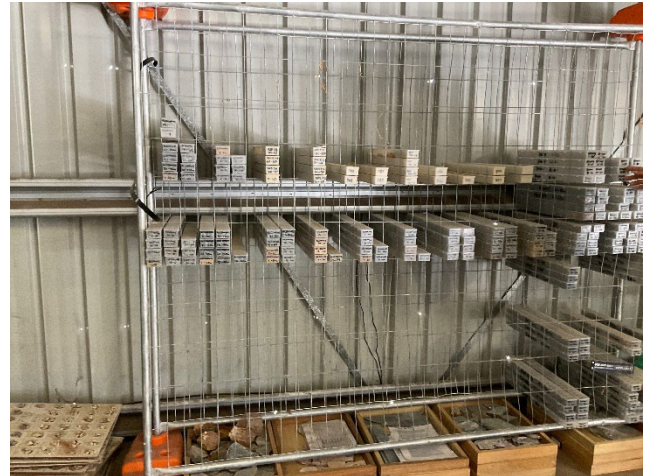
Figure 7 Well organised chip sample storage by hole number