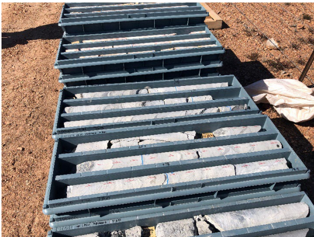
Figure 6 Typical core sample layout in plastic core trays