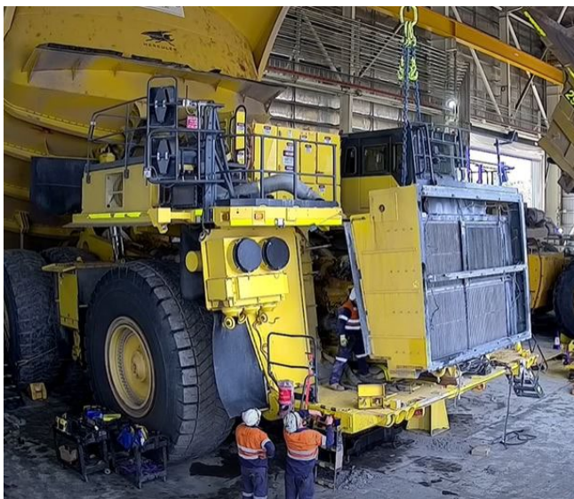
Figure 2: Worker moves clear of moving module