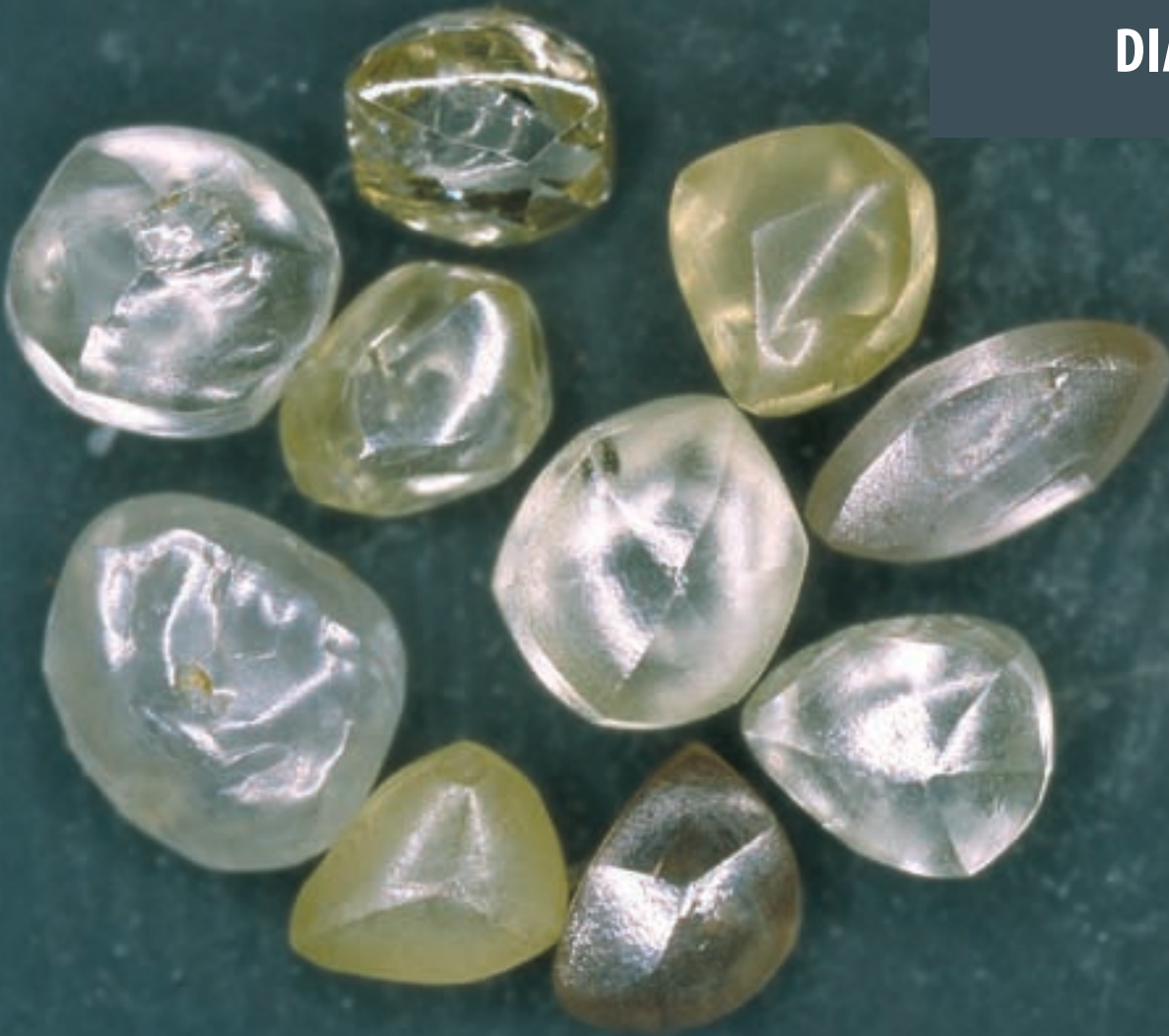
Photograph 4. Rough diamonds from New South Wales (enlarged). The state was formerly the largest producer of diamonds in Australia, which were obtained mainly from alluvial deposits near Copeton and Bingara in the New England region. There is good potential for additional diamond resources in New South Wales.