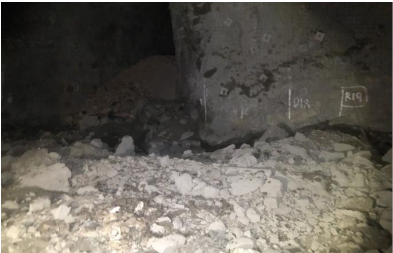
Figure 1: Post-incident photo of 21L showing floor heave in line with mark-up of the charge holes (painted on wall).

During the re-entry post-firing it was identified that the 25L Nth production stope had not been disconnected from the mains firing line and there had been an unplanned initiation of some electronic detonators in the stope.