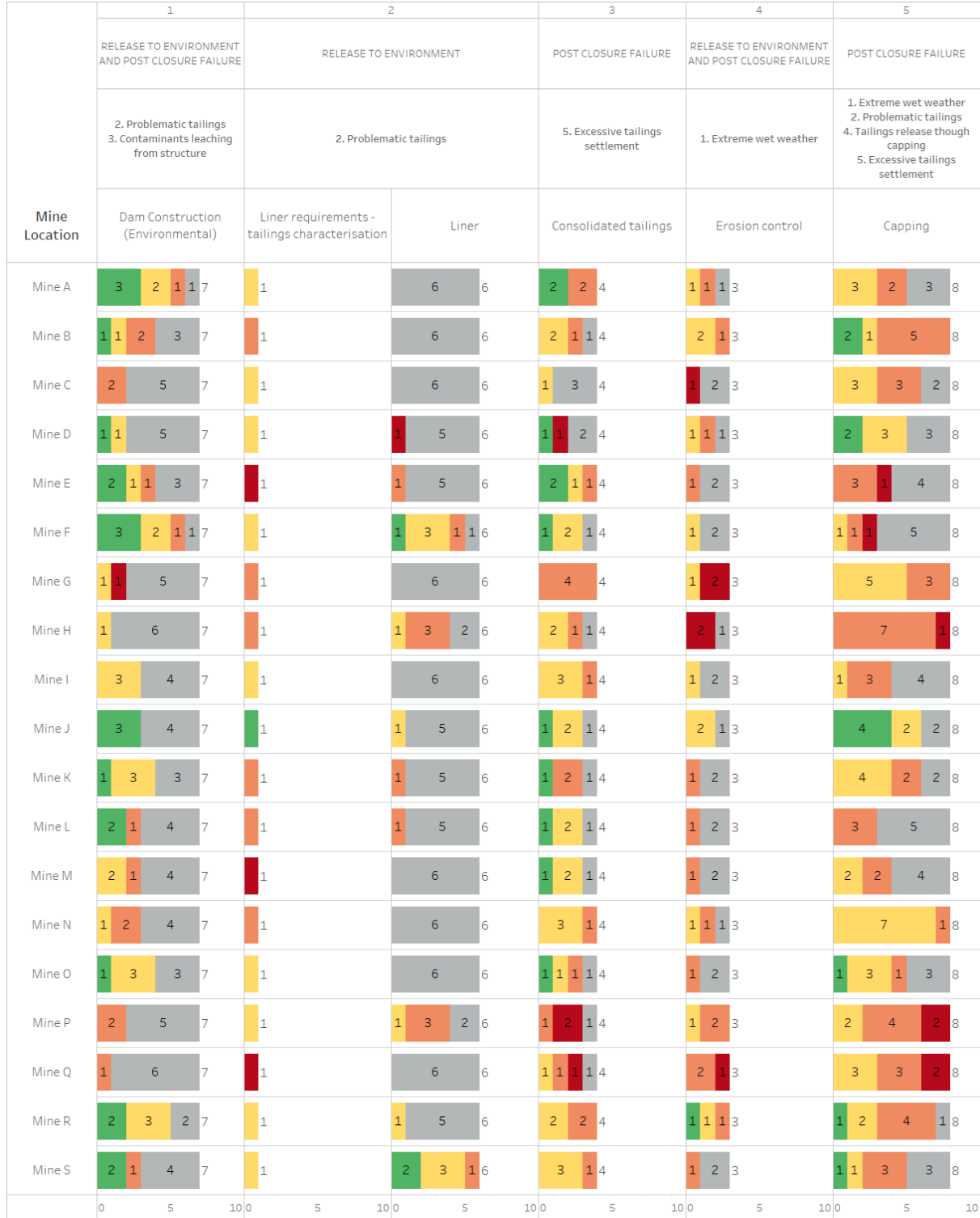
Figure 1: Assessment criteria (control support) scoring results by mine and critical control